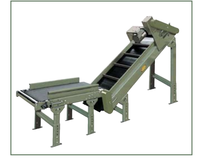
FEEDER SHOWN WITH STANDARD PC TYPE GUARD RAIL, GRAVITY BRACKET WITH POP-OUT ROLLER AND OPTIONAL MS TYPE FLOOR SUPPORTS

CAPACITY-300 lbs. total distributed load at 65 FPM.